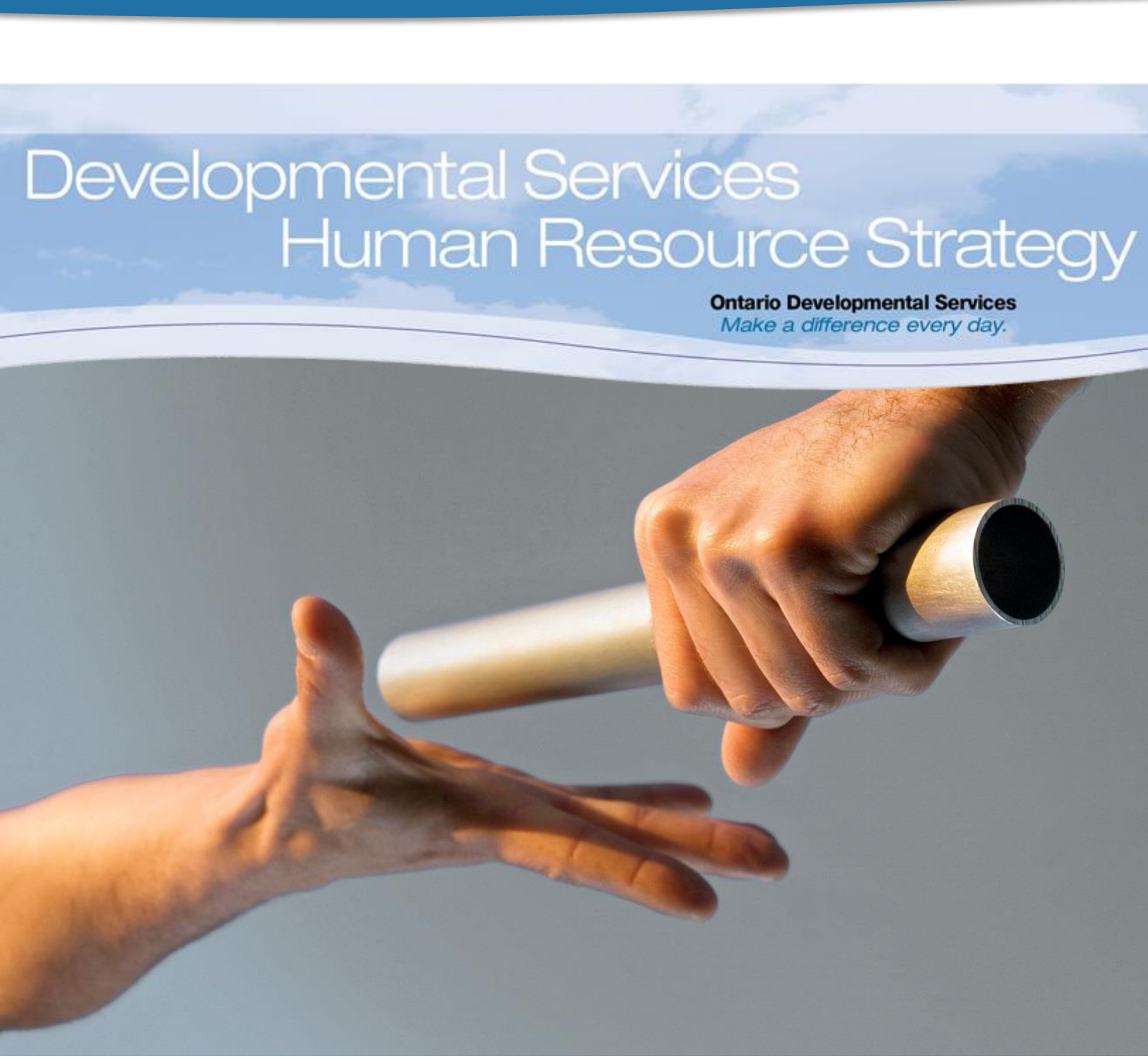
Talent Management and Succession Planning Guide for Agencies in the Developmental Services Sector